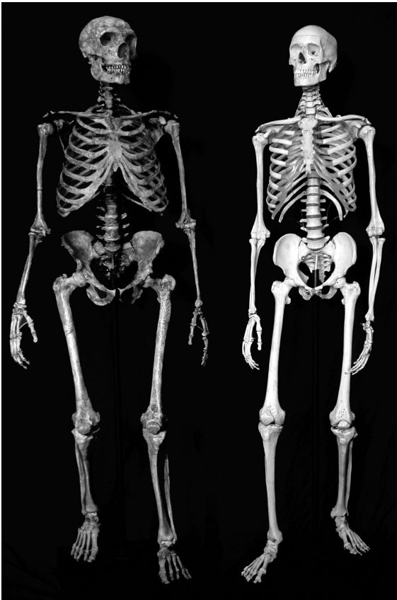
Figure 1. Front and side views of the composite Neanderthal skeleton reconstructed by G.J. Sawyer and Blaine Maley.